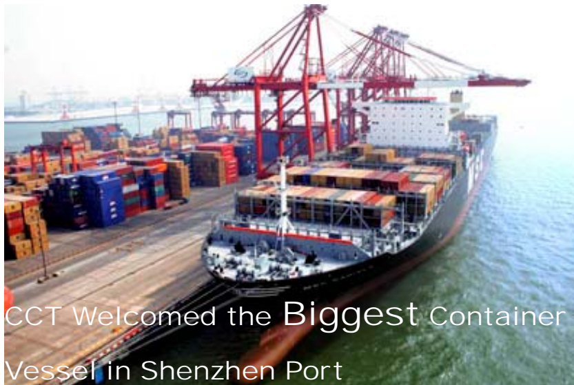
CCT Welcomed the Biggest Container Vessel in Shenzhen Port